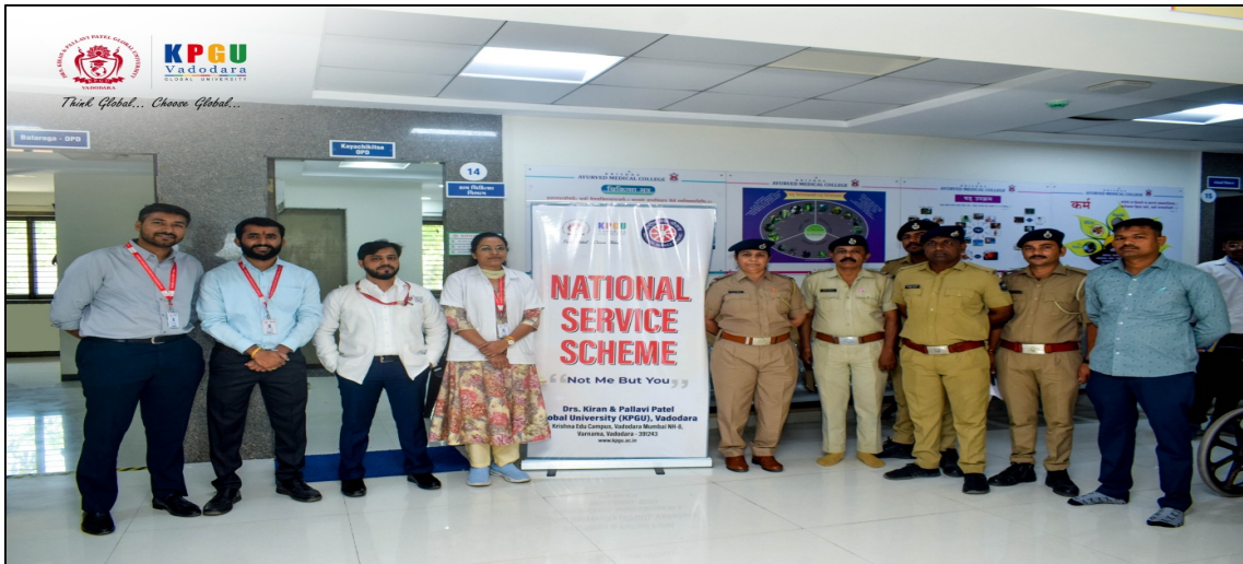
Group photo of Hospital staff with police staff in police health checkup camp.